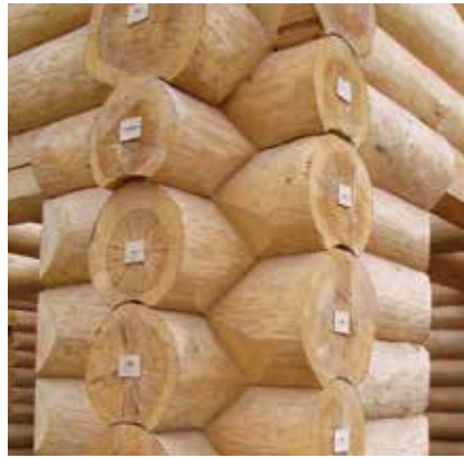
Saddle notch round log