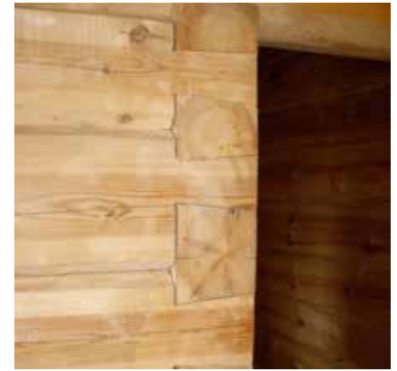
Done tail log

We have produced handmade buildings of over 1000sqm (11,000 square foot), all corner notches are 'hand scribed' by craftsmen and the cabin is fully assembled in our workshops prior to shipping.