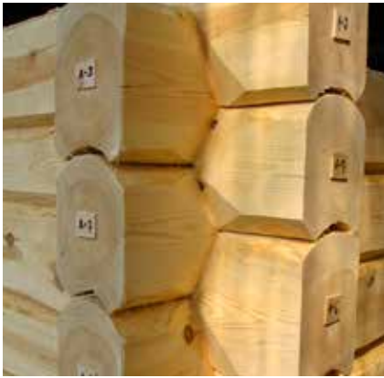
Saddle notch square log